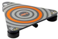
PRS-1 resistance test probe