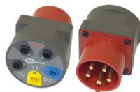
Three-phase socket adapter 16 A / 32 A