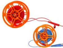
Test lead for earth resistance measurement 25 m red / blue