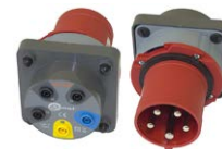
Three-phase socket adapter 63 A